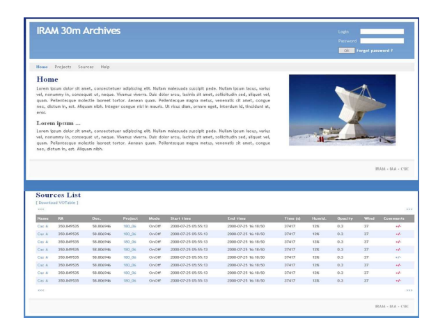
Fig. 2 Based upon use cases requested among advanced users, the IRAM 30m VO archive interface prototype is the template for the upcoming functional web interface. It will allow accessing headers data from projects, sources, scans, etc. The output formats will be chosen by the user (VOTable, HTML, ASCII) besides the filter criteria. Developed following VO standards it will bring in addition VO services for external querying.

The development of the IRAM 30m VO archive is being done in collaboration with IRAM. TAPAS<sup>8</sup> is an archive of headers data, the data model is based on RADAMS [9] and on IRAM 30m NCS<sup>9</sup> data structure. The archive is filled in real time thanks to a datafiller developed in Python scripting. A prototype for the web access interface has been designed following scientific use cases. It will allow data retrieval via user-friendly forms, in addition to ConeSearch [12] and SSAP [11] VO services.